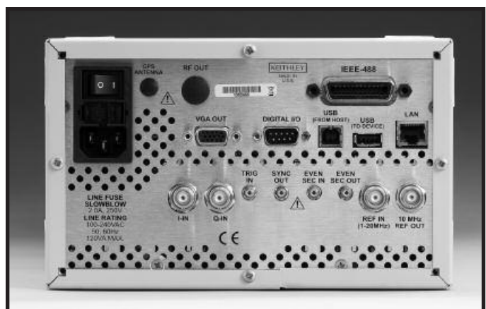
Figure 3. The Model 2910 rear panel.

For additional information on the Model 2910 and complete specifications, visit our website at www.keithley.com