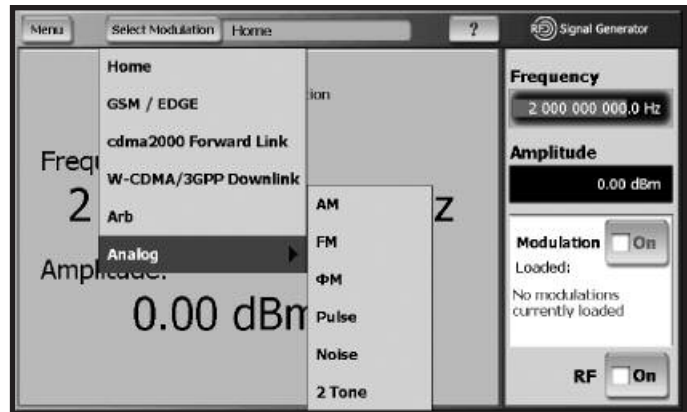
Figure 2. The Model 2910 features an intuitive GUI that simplifies selecting, creating, or editing a variety of waveforms.

The Model 2910 is the latest addition to our expanding RF/wireless test offering. In fact, Keithley serves many stages within the wireless industry, starting with our automated DC/RF parametric test systems for wafer-level testing. Component manufacturers often choose Series 2400 and 2600 SourceMeter® instruments for high speed DC testing of packaged parts like RFICs. Keithley's high speed power supplies and battery/charger simulators are widely used in board-level handset testing and our THD Multimeters and Audio Analyzing DMMs are popular choices for audio test systems. We also have a broad array of RF/microwave signal routing solutions, in both standard and custom configurations, ranging from stand-alone switches and simple plug-in modules for multimeters to fully integrated turnkey solutions designed for production test applications.